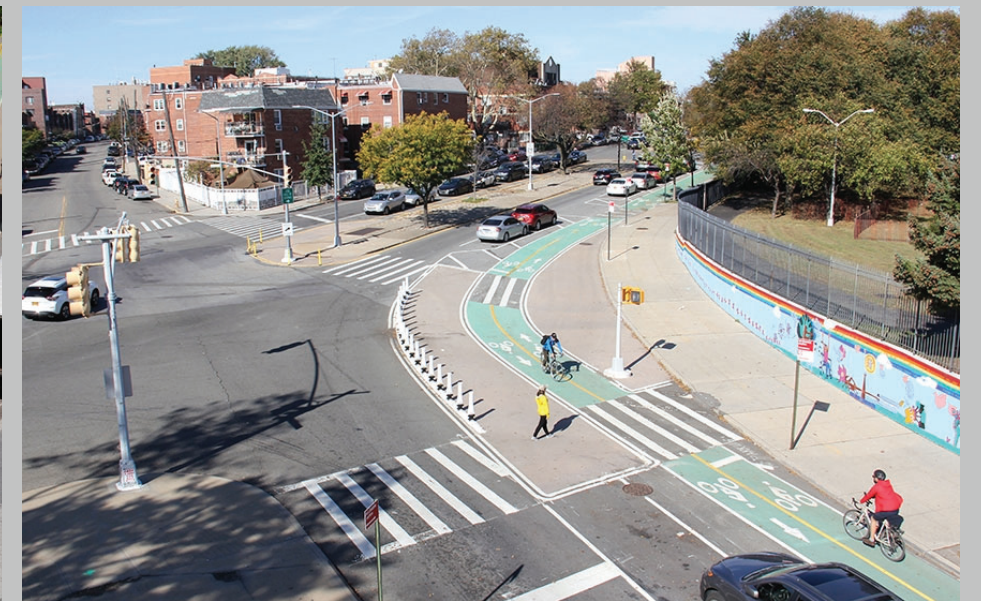
Project examples using resin bonded stone surfacing materials