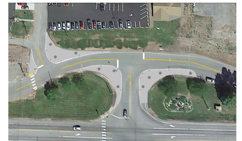
Warren/Dawson Intersection Planning Only - unfunded