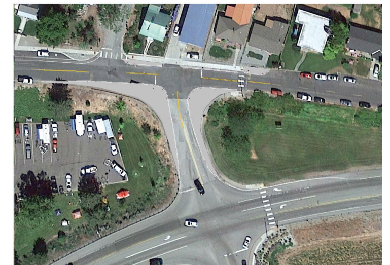
Warren/North Intersection Planning Only - unfunded